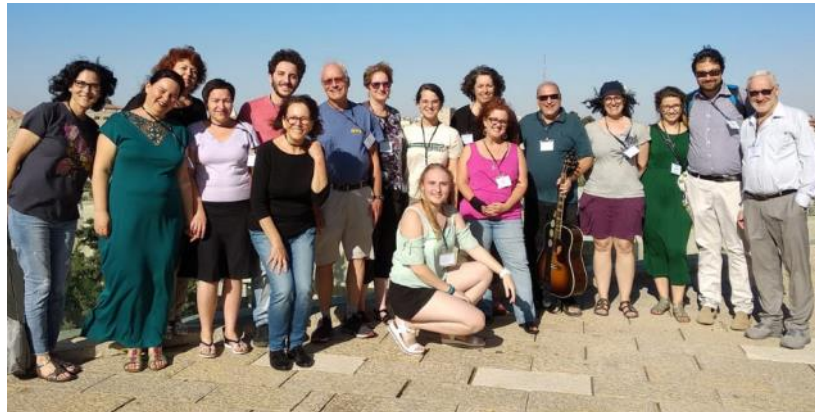
2018 Bergman Seminar participants

The seminar challenges and motivates Jewish educators about Israel and world Jewry, creating a deep and meaningful connection to bring back to share with their students. The seminar emphasises the four central components of Jewish existence: the Jewish people, the Torah, the State and the Land of Israel.