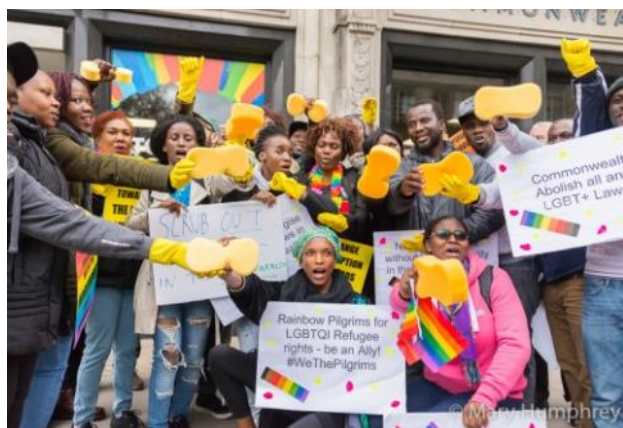
Rainbow Pilgrims equipped with placards and flags

to the Commonwealth Headquarters. They stopped at some high commissions to hear stories from LGBTQI+ artists and activists from places of conflict.