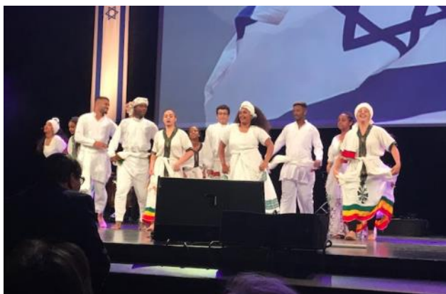
Nachalat Yehuda dancers