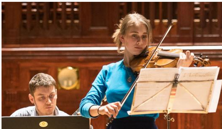
Singers and musicians from the Lauder School Prague

renowned illustrator and artist, gave a fascinating presentation.