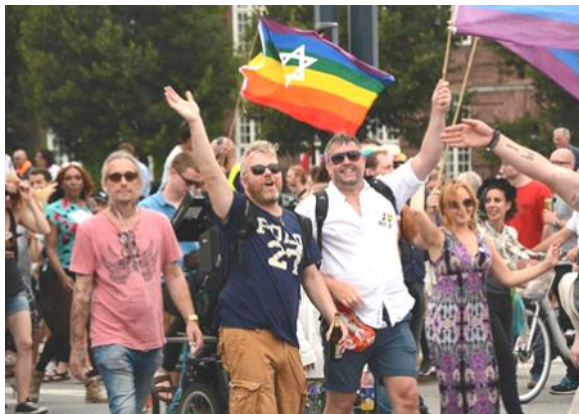
Happy Shir Hatzafoon members in Copenhagen Pride