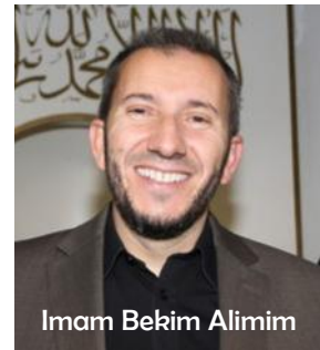
Imam Bekim Alimi