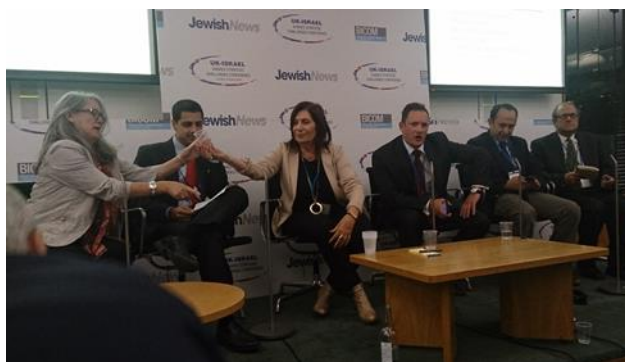
UK-Israel conference panelists

As vice-chairman of EUPJ I was invited to attend the above conference at the House of Commons, Portcullis House on June 22 nd .