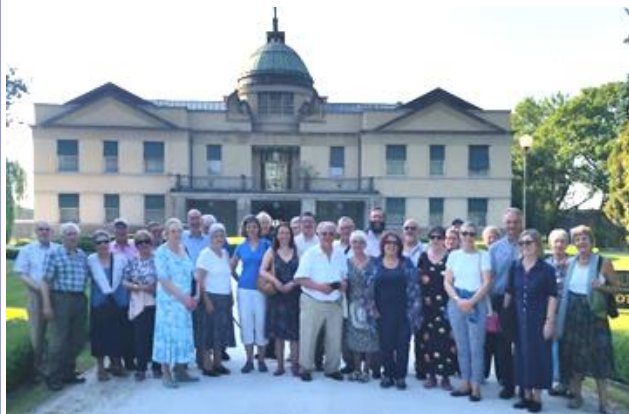
Members of three Progressive congregations in Kolin

In early June members of three Progressive congregations spent a weekend in Kolin, Czech Republic. Northwood & Pinner and South London Liberal Synagogues were joined by Shir Hadash from Los Gatos, California. All three have a Westminster Czech Memorial Torah from Kolin, and an actual Kolin Torah was brought over from Arizona by the leader of a Reform Jewish Scout troop who regularly use the scroll.