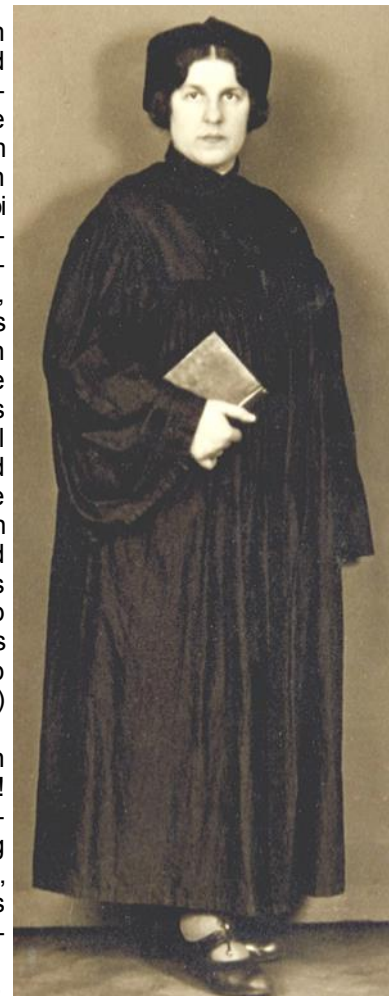
Rabbi Regina Jonas