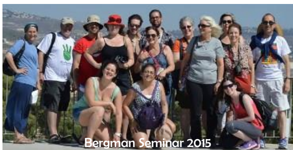
Bergman Seminar 2015

I am still glowing after this summer's amazing Bergman Seminar for Progressive Jewish Educators. To spend ten days working with this passionate and talented group of educators from Argentina, Brazil, England, France, Germany, India, Poland, Spain and the United States was a wonderful gift.