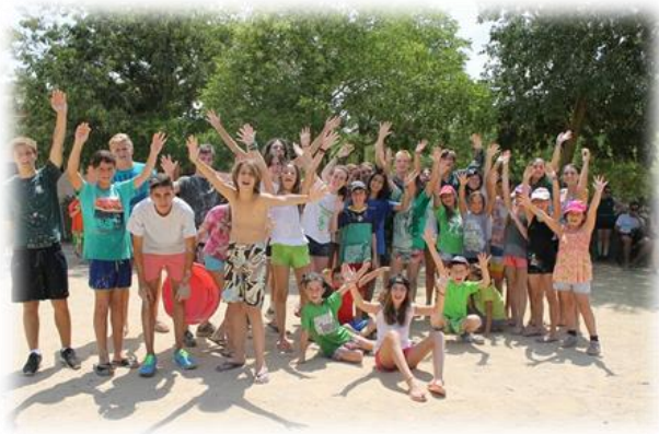
Netzer Barcelona's Majané Midbar

After nine days in Netzer Barcelona's "Majané Midbar" summer camp, we felt like there's no other place we would rather be. We have had all types of experiences and emotions day after day as we learned about our Judaism and personal identity. From ages six to 20 we woke up every morning with a whole exciting and new day awaiting us. We celebrated being part of our youth movement during Yom Netzer where we got on a cardboard airplane and visited all the countries where Netzer is. Field trips, our official Olympics "Bobolimpiadas", and night peulot on Israel's history were only a small part of everything we shared together. Each age group learned about our three pillars: past and legacy as Progressive Jews, what our Zionism means, and the way we live our Tikun Olam, repairing the world together.