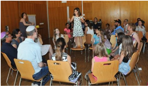
Children's Talmud Torah in Lausanne